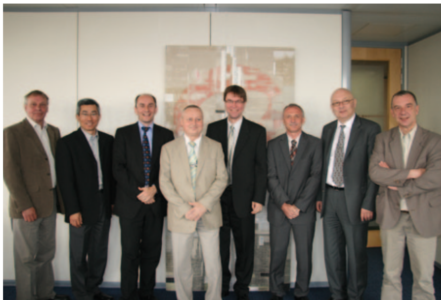
FEFCO Production Committee