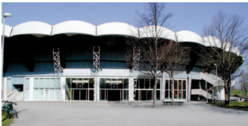
Event Arena Olympiapark

As in the past, the programme will offer a variety of interesting and actual topics and will focus on technical aspects as well as on everyday applications and case studies